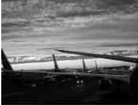
Some 44 international flights carrying 8,800 passengers were diverted to Halifax International Airport.

that the whole community pulled together too. For example, cruise ships in the port of Vancouver became hotels for passengers who couldn't fly out.