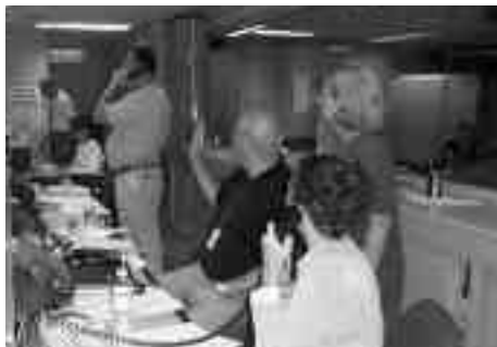
The SitCen quickly became the focal point for decisions and actions.

The SitCen was designed as a communications centre, capable of coordinating an emergency response to a huge earthquake on the west coast. The quake, which many experts believe is inevitable, hasn't happened. However, the SitCen has been activated many times over the years, including during the ice storm in Ontario