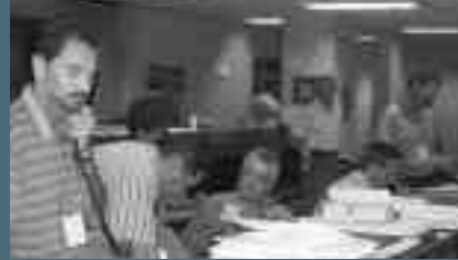
Decisions made in the SitCen included granting clearance for humanitarian flights.