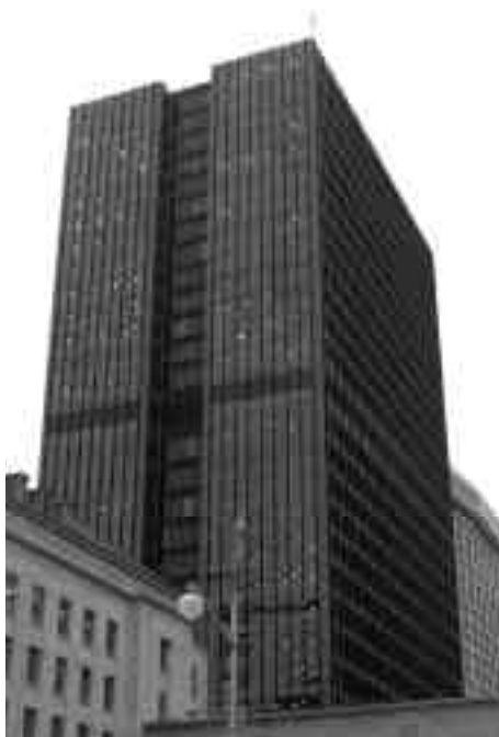
Place de Ville, Tower C.

A labour dispute between the Government of Canada and the Public Service Alliance of Canada (PSAC) had been simmering since July. PSAC called a one-day national strike for the 11 th . In downtown Ottawa, Transport Canada was an obvious location for strike action. Tower C of Place de Ville is the head office for Transport Canada and home to thousands of employees. It also happens to be the tallest building in Ottawa. Union members encircled Tower C with a picket line.