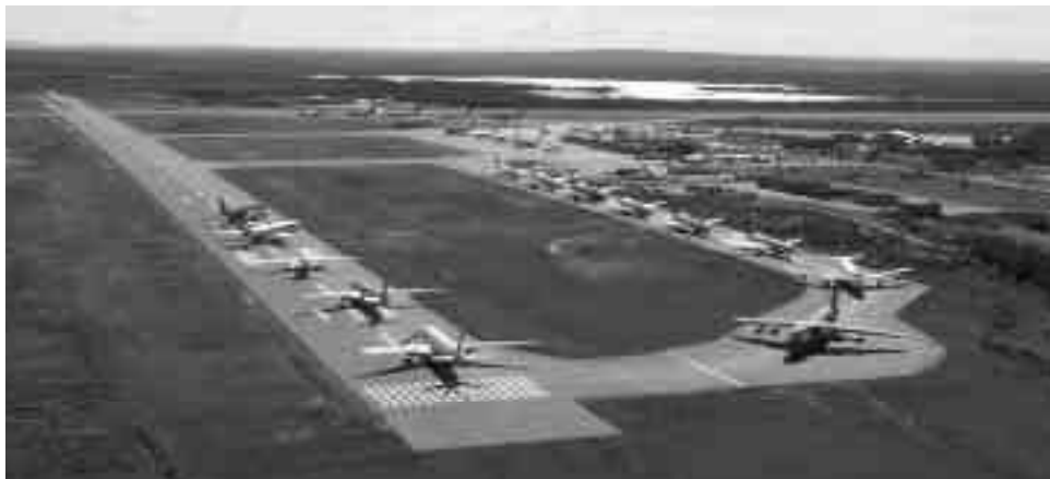
Diverted planes stacked up at Gander Airport.