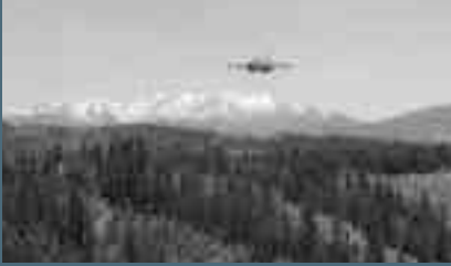
A Korean plane approaches Whitehorse Airport.